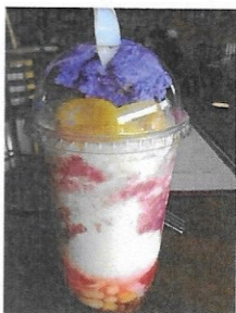
HALO-HALO / MIX-MIX $8.75 "DESSERTS"